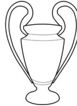
The 3Rs Talent Award

“However, the easy access to animal facilities and the associated competences might result in animal testing automatically becoming the researcher’s go-to for answering a given research question. Rather, the choice of method should be based on what is the most scientifically robust route to a valid answer.”